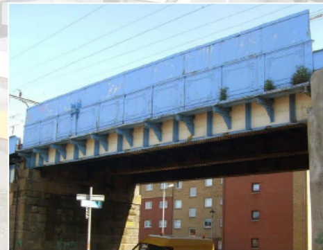
Elevation of the existing cast iron

This highlighted structural defects and the proposed repair and refurbishment operation.