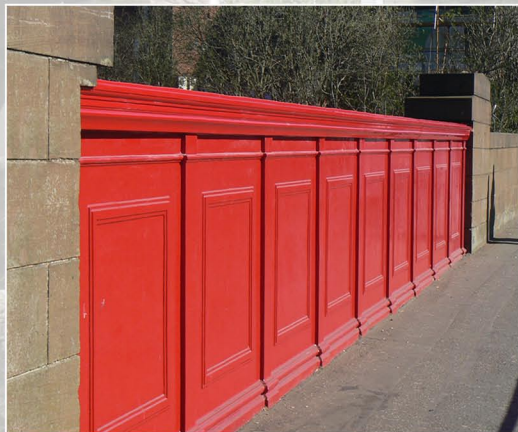
Both sides of the bridge were refurbished.