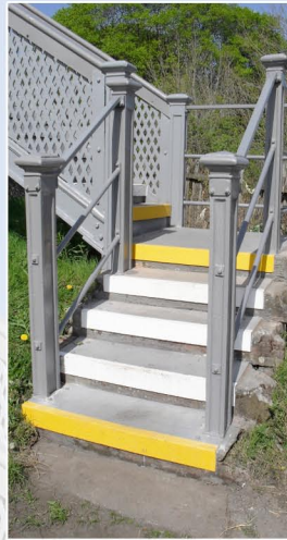
GRP Replica Columns

MSD Design Ltd produced GRP replica columns, column heads, banisters and non-slip walkways & stair treads.